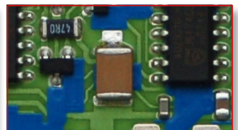
x12 zoom, 30x magnification