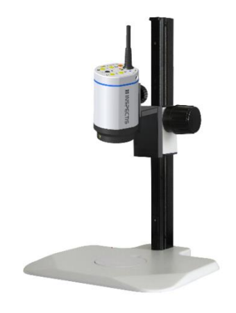
V2, 2018 www.inspect-is.com